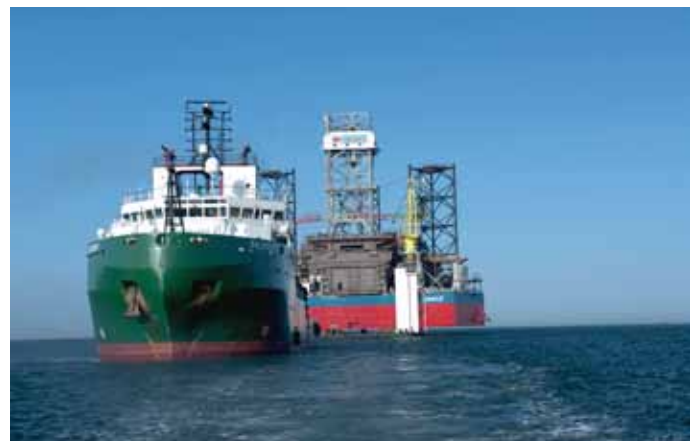
12,000BHP 150TBP AHT Salviceroy station keeping for POSH GIANT 3's Float-Off Operations