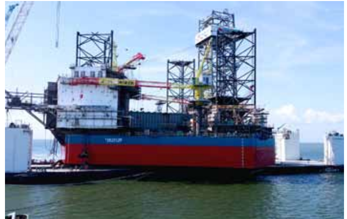
TAM DAO 05 loaded on submersible barge POSH GIANT 3

The project was awarded to POSH by builders M/S PetroVietnam Marine Shipyard as a fast track contract. There was a short lead time from the signing of the contract in May 2015 leading to the execution phase in November 2015. The Project Management Team participated in numerous hours of discussions and planning to devise engineering and execution plans to ensure a seamless and successful operation.