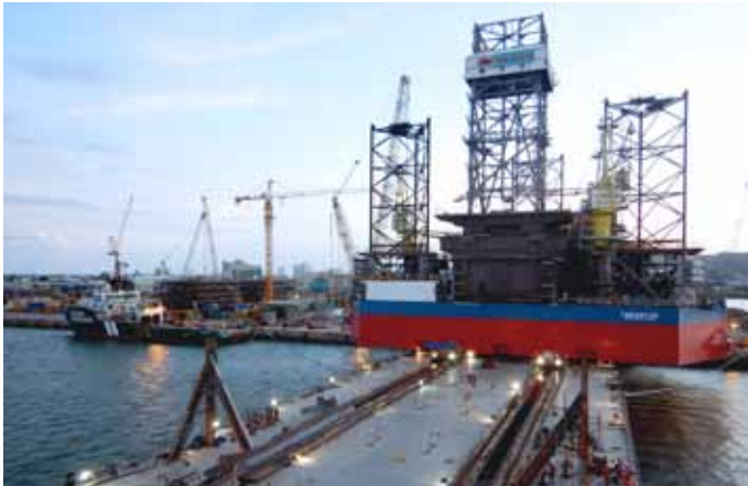
Load Out onto POSH Giant 3 by skidding operations