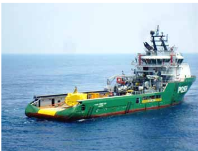
16,000BHP AHTS DP2 POSH Constant delivering X-Tree for Scarabeo 7, offshore Indonesia