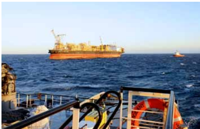
Salvigilant approaching to tow the FPSO Stybarrow Venture MV16