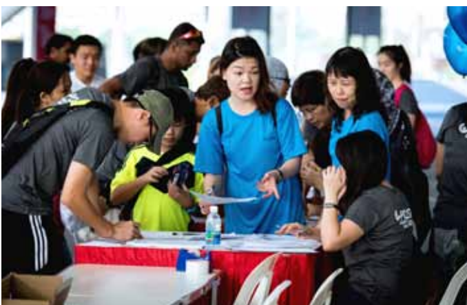
Participants lining up to register for the walk and their free goodie bags!

After flagging off from the newly opened National Stadium, participants made their way across a carefully planned route which brought them through the scenic Bay East Garden and the Marina Barrage. The route finished off at the Gardens by the Bay, where the participants were encouraged to spend the rest of the day enjoying the sights and attractions with their friends, family and colleagues.