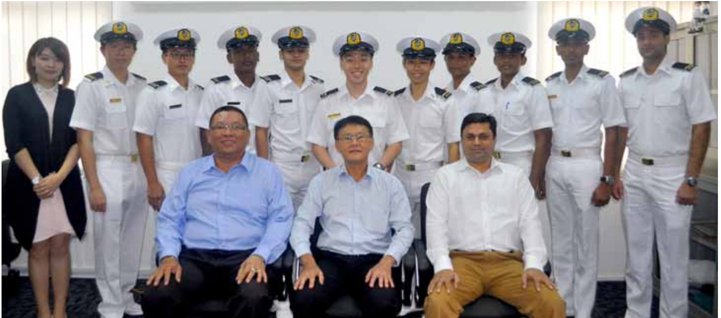
Presenting the first batch of POSH sponsored cadets from ALAM

24 October 2015 was a memorable day for 15 cadets from Akedemi Laut Melaka (ALAM) as they completed the first phase of their training before embarking on their sea training phase.