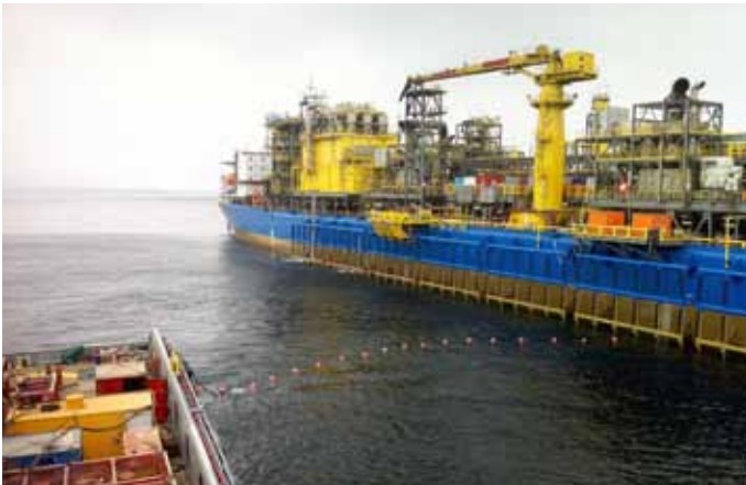
Nitrogen Injection in progress with buoys attached to the hose

It has been almost two years since POSH Skua first started working in Angolan waters. POSH Skua is still the preferred choice of charterers due to its deck cargo capacity, accommodation capacity, accurate station-keeping and low fuel consumption.