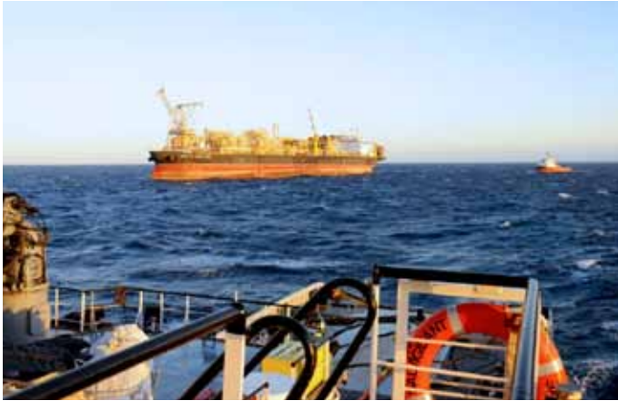
Salvigilant approaching to tow the FPSO Stybarrow Venture MV16