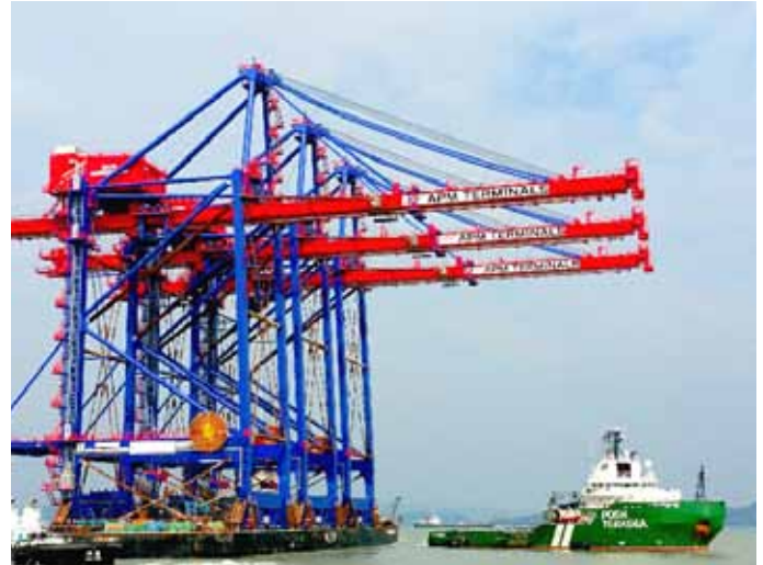
12,000BHP 150TBP AHT Salvigilant towing POSH Giant 1 loaded with three STS cranes out of Zhangzhou, China