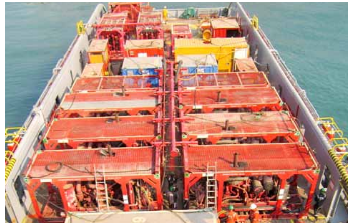
Overview of the equipment loaded at the Port of Amboim, Angola

In early August 2015, POSH Skua successfully completed her most challenging operation – the nitrogen injection (dewatering)* of N’Goma Floating Production Storage and Offloading unit (FPSO) after more than a month of planning and hard work by POSH personnel together with the charterers.