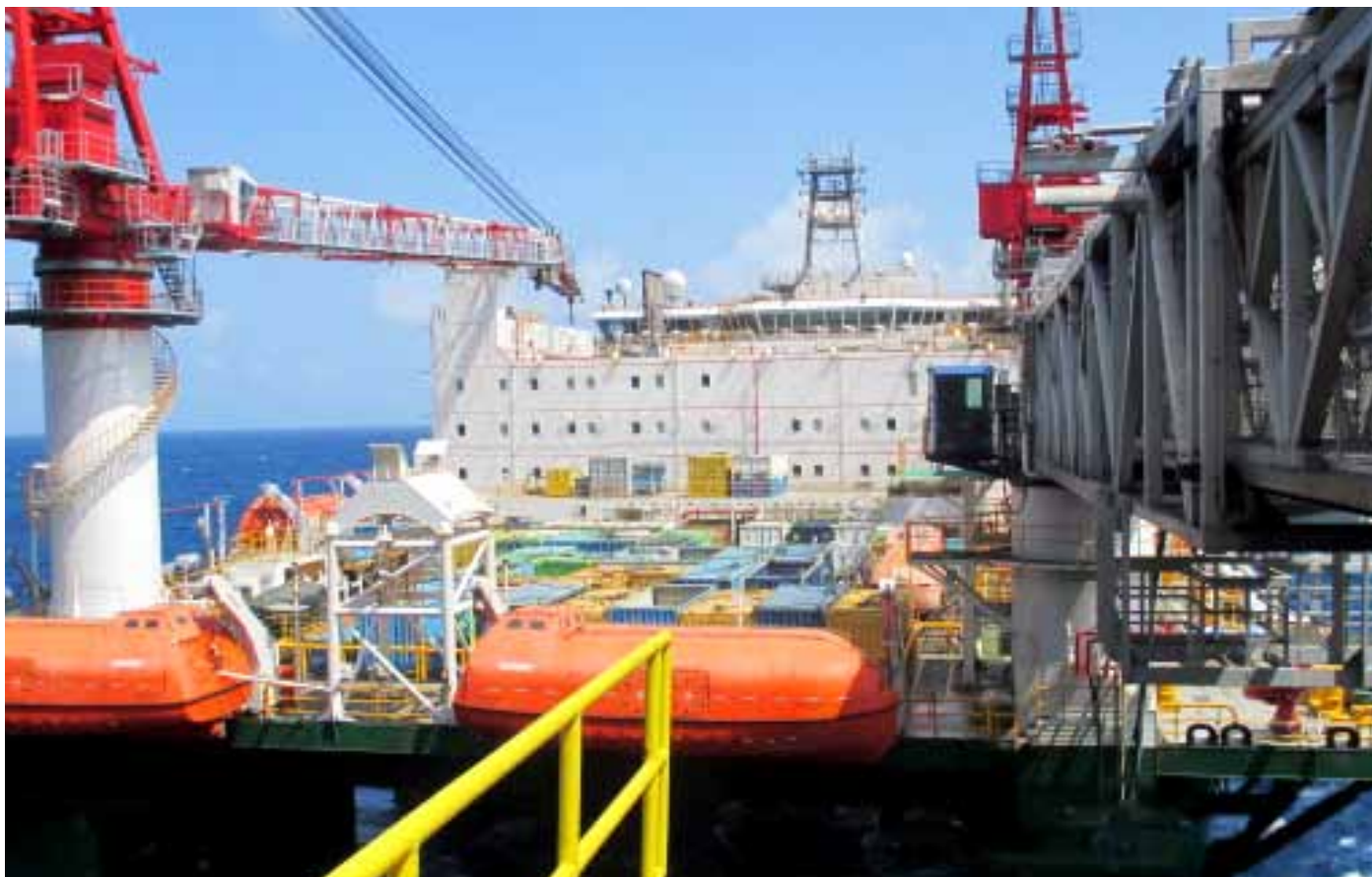
View of the large deck area on POSH Xanadu, from the FPSO platform