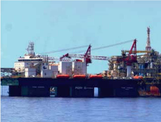
750 POB DP3 SSAV POSH Xanadu supporting a FPSO at offshore Brazil