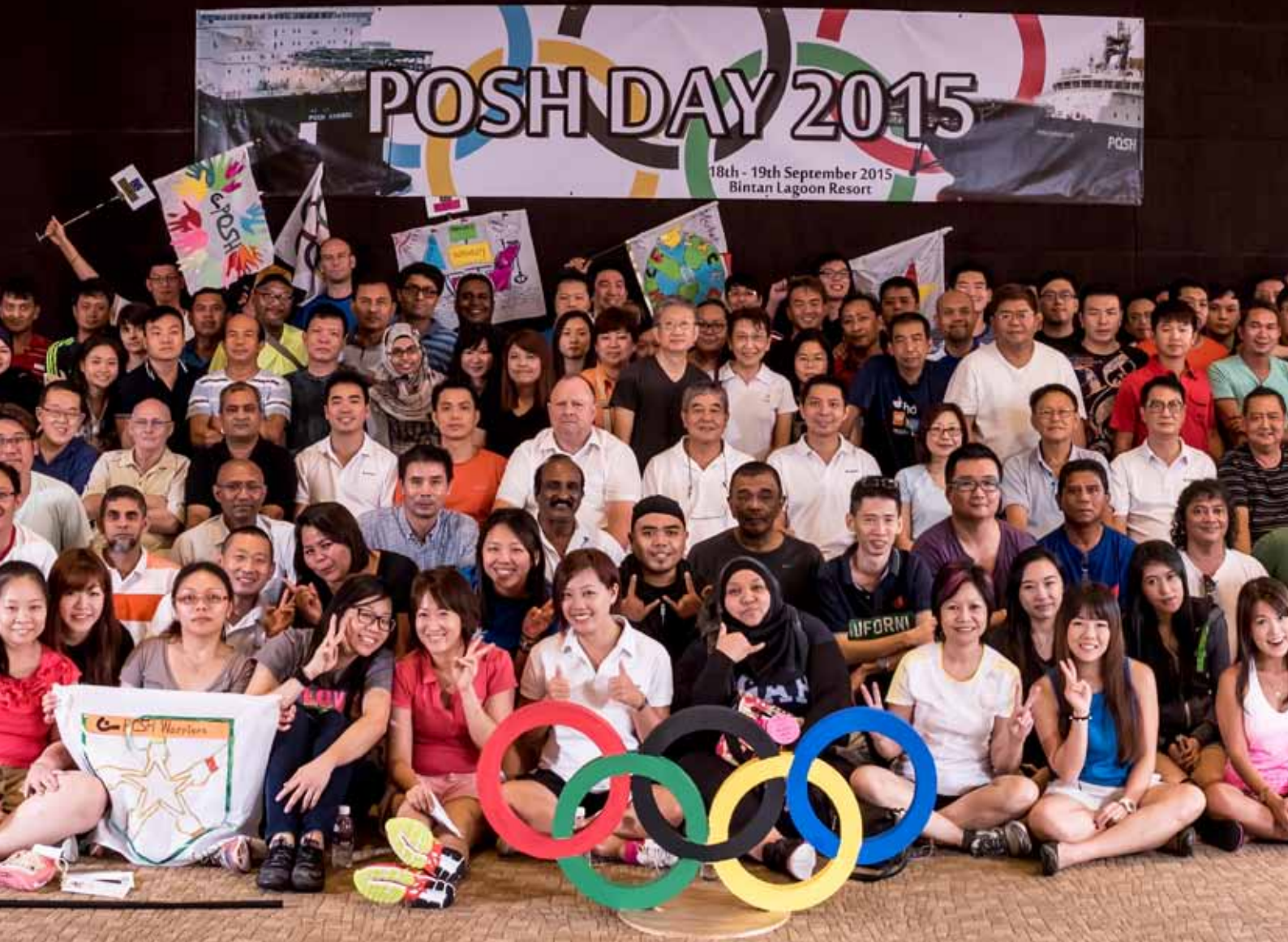
POSH Day 2015, Bintan Lagoon, Indonesia