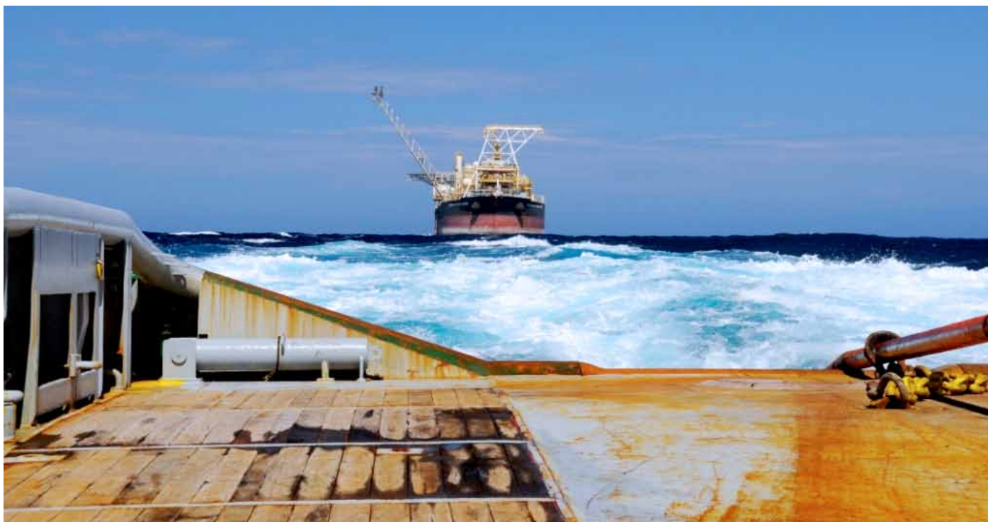
MV16 on tow as seen from Salvigilant deck

“I would like to thank you for support and professionalism shown during the operation and recognise that the operation was a complete success.” – MV16 Master