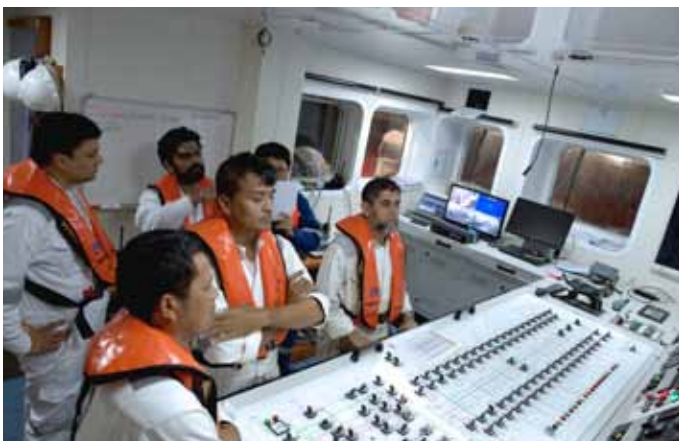
Project team in action during Float Off Operations

This was a milestone project for POSH’s Transportation and Installation division (Deepwater) as it involved the execution of operations beyond traditional ocean towage and marine transportation. The scope of work included the provision of the main towing tug, semisubmersible barge, project team, full engineering scope and the float off execution. The project team executed the skid on and float off smoothly without incident and was handed over to the owner without a scratch.