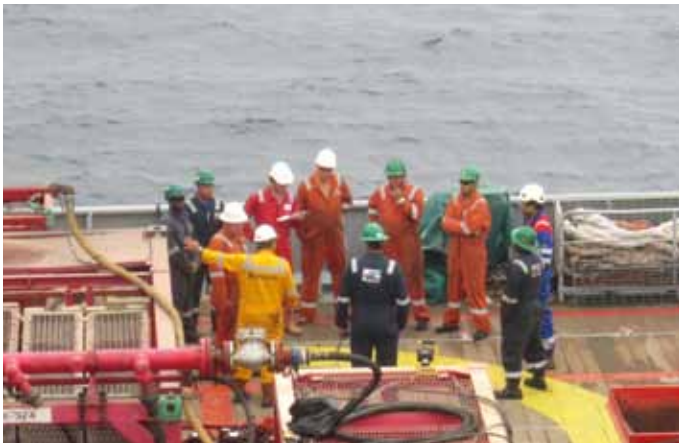
Crew huddling for one last discussion before the commencement of the operation