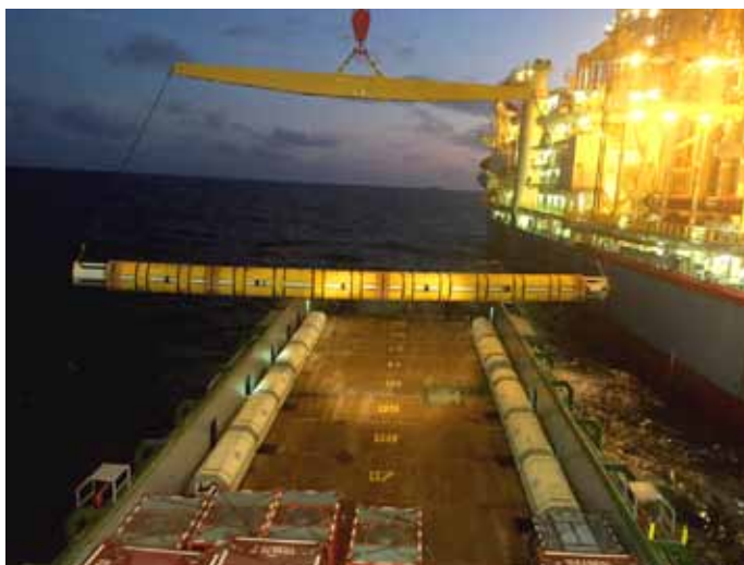
4,100DWT DP2 PSV POSH Skua loading up on risers at offshore Luanda, Angola