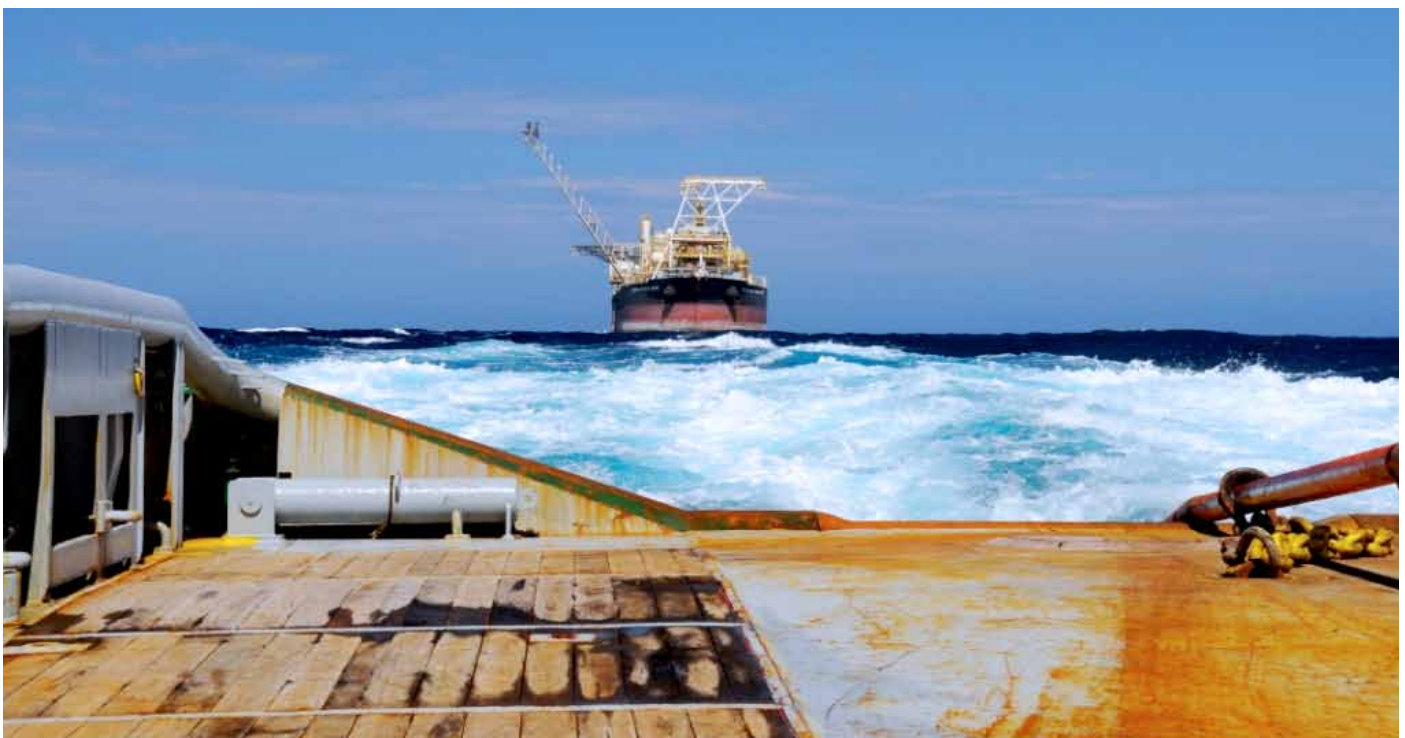
MV16 on tow as seen from Salvigilant deck

“I would like to thank you for support and professionalism shown during the operation and recognise that the operation was a complete success.” – MV16 Master