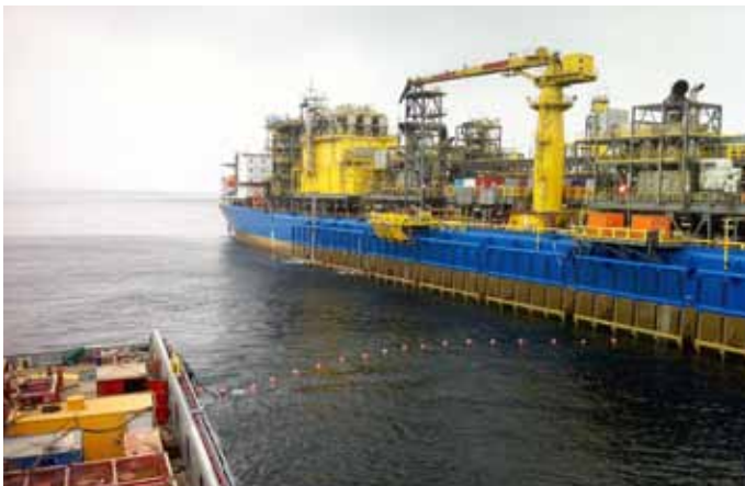
Nitrogen Injection in progress with buoys attached to the hose

It has been almost two years since POSH Skua first started working in Angolan waters. POSH Skua is still the preferred choice of charterers due to its deck cargo capacity, accommodation capacity, accurate station-keeping and low fuel consumption.