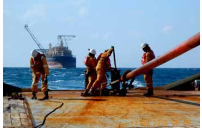
Crew preparing for tow hook-up

POSH 150TBP AHT, Salvigilant, safely completed the towage of the FPSO Stybarrow Venture MV16 from Stybarrow Field, Australia, to Vung Tau, Vietnam. The FPSO was singly towed on a route approximately 2,300 nautical miles long, and at an average speed of 5.7 knots. The voyage was completed in 16 days.