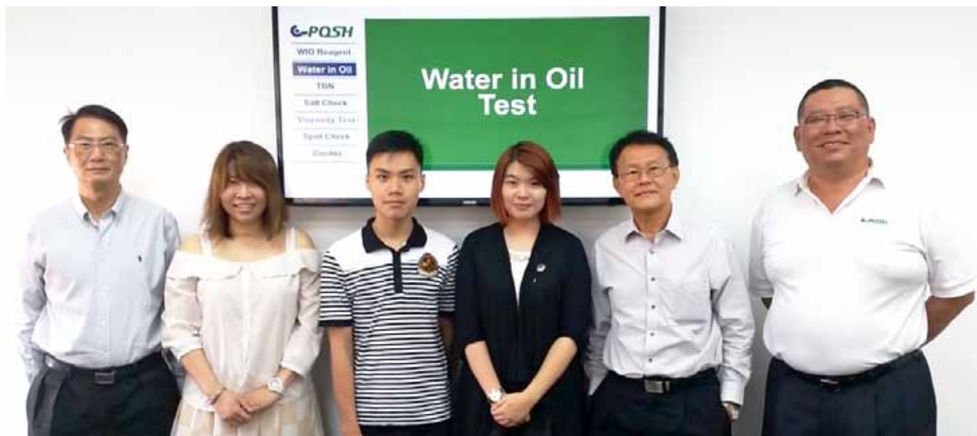
POSH officially launched the in-house produced Onboard Lube oil Care & Test Interactive Multimedia package on 1 May 2015

This project was a collaboration between POSH and Singapore Polytechnic's School of Digital Media and Infocomm Technology.