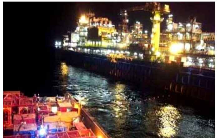
Operation extending late into the night

“ * DID YOU KNOW: Nitrogen Injection (dewatering) is a process in which an old oil reservoir - one where the current production rate is no longer economically viable - is injected with nitrogen gas to improve oil recovery. The injected gas generates pressure which drives the oil into the wellbore, enhancing existing production by as much as 2-3 times. ”