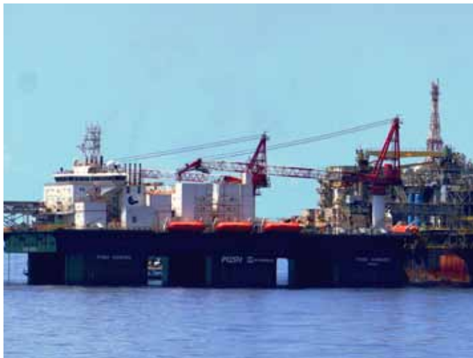
750 POB DP3 Ssav POSH Xanadu supporting a FPSO at offshore Brazil