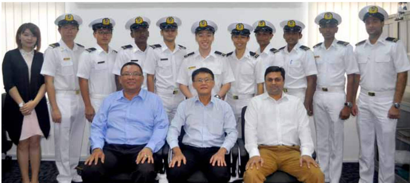
Presenting the first batch of POSH sponsored cadets from ALAM

24 October 2015 was a memorable day for 15 cadets from Akedemi Laut Melaka (ALAM) as they completed the first phase of their training before embarking on their sea training phase.