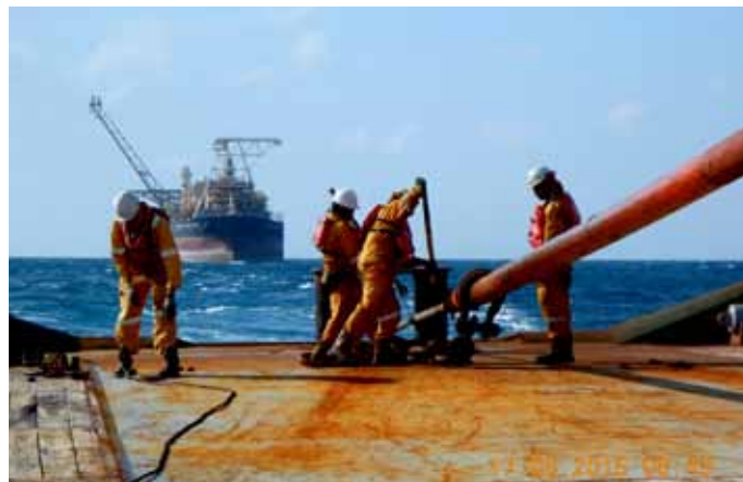
Crew preparing for tow hook-up

POSH 150TBP AHT, Salvigilant, safely completed the towage of the FPSO Stybarrow Venture MV16 from Stybarrow Field, Australia, to Vung Tau, Vietnam. The FPSO was singly towed on a route approximately 2,300 nautical miles long, and at an average speed of 5.7 knots. The voyage was completed in 16 days.