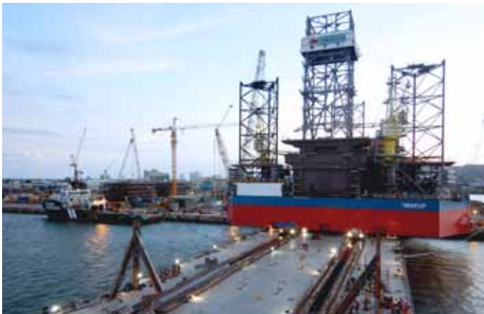
Load Out onto POSH Giant 3 by skidding operations