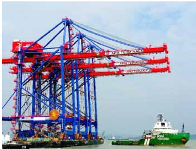
12,000BHP 150TBP AHT Salvigilant towing POSH Giant 1 loaded with three STS cranes out of Zhangzhou, China