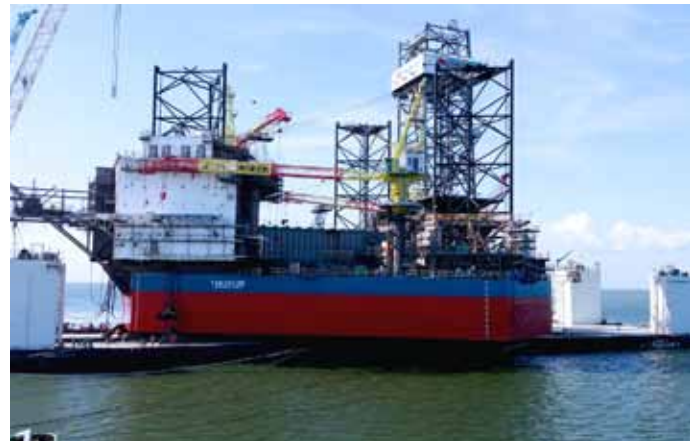
TAM DAO 05 loaded on submersible barge POSH GIANT 3

The project was awarded to POSH by builders M/S PetroVietnam Marine Shipyard as a fast track contract. There was a short lead time from the signing of the contract in May 2015 leading to the execution phase in November 2015. The Project Management Team participated in numerous hours of discussions and planning to devise engineering and execution plans to ensure a seamless and successful operation.