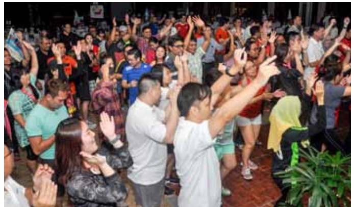
Some highlights of the event

On 18 and 19 September 2015, POSH Day 2015 was held 2015 at Bintan Lagoon Resort, which saw the participation of more than 170 members of the POSH family. The main focus this year was to reinforce the five Core Values of POSH- Teamwork, Accountability, Integrity, HSEQ and Market Focus. Over two days, participants engaged in wacky and witty games which incorporated these core values. The games and activities were excellent opportunities for participants to put teamwork into practice as well as showcase their sportsmanship and leadership qualities.