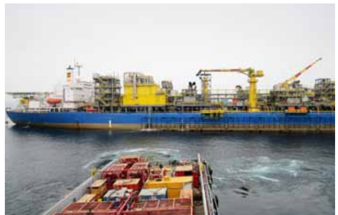
POSH Skua approaching the FPSO to commence transfer operations