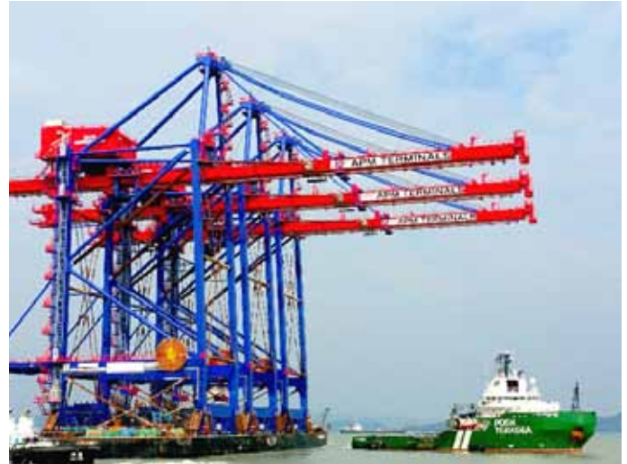
12,000BHP 150TP AHT Salvigilant towing POSH Giant 1 loaded with three STS cranes out of Zhangzhou, China