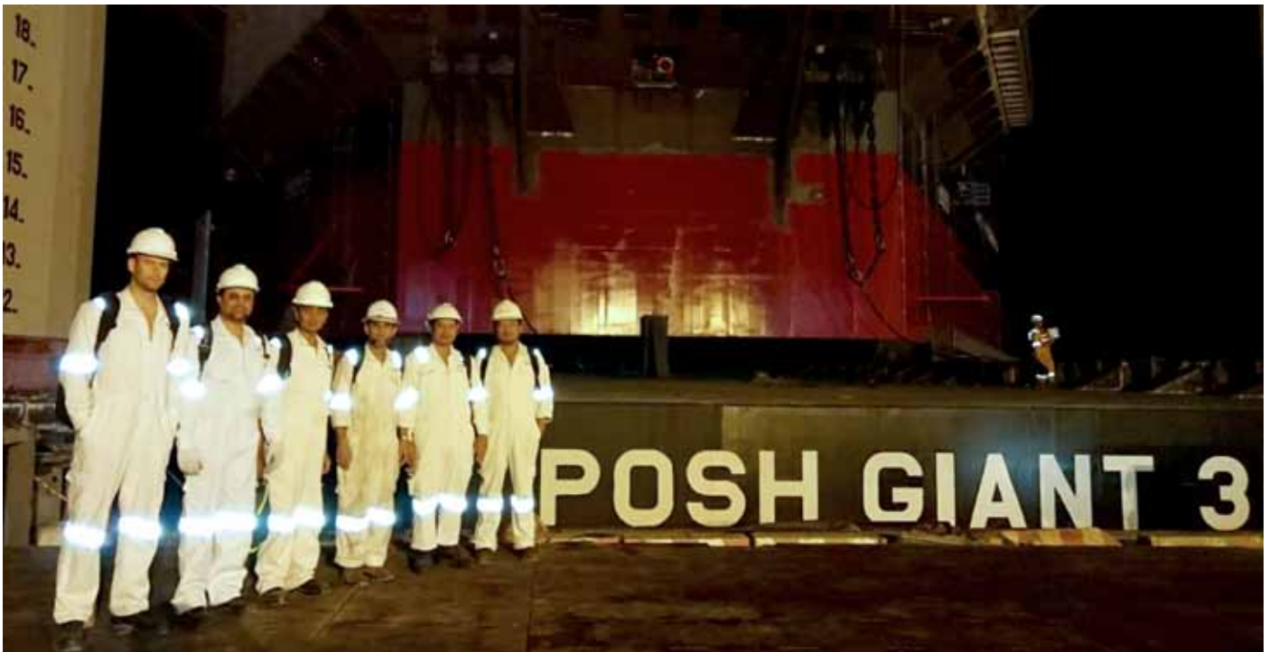
Project team photo during Load-out / Float-off operations

The project was awarded to POSH by builders M/S PetroVietnam Marine Shipyard as a fast track contract. There was a short lead time from the signing of the contract in May 2015 leading to the execution phase in November 2015. The Project Management Team participated in numerous hours of discussions and planning to devise engineering and execution plans to ensure a seamless and successful operation.