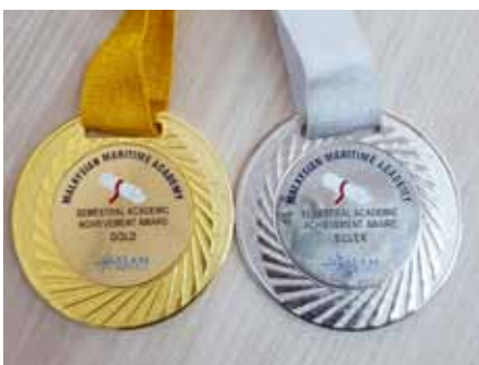
Gold and silver medals ready for presentation

The ALAM cadets will be completing a one-year sea service on POSH vessels as part of phase two of their training program.