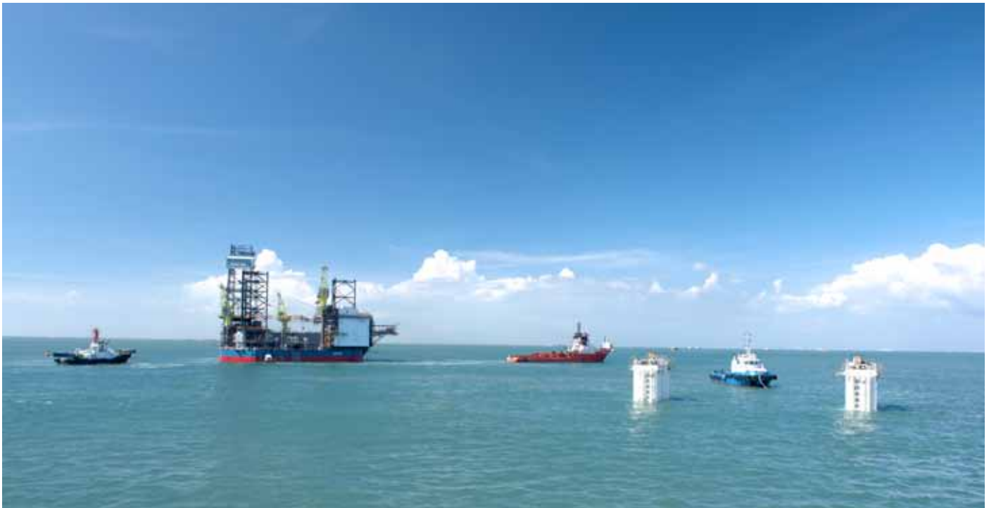
Float off completed, TAM DAO 5 handed over to harbour tugs

P OSH successfully floated-off the largest self-elevating drilling rig ever built in Vietnam, TAM DAO 5 off Vung Tau, Vietnam. The TAM DAO 5 weighs in at 13,000 tons and is designed to accommodate 140 people and a maximum payload of 6,488 metric tons.