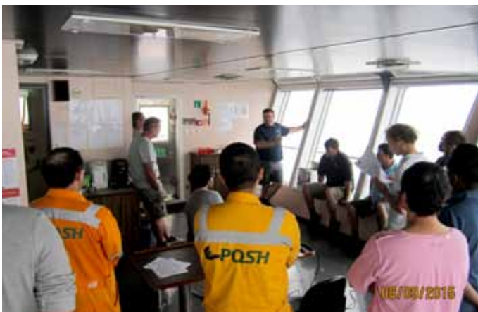
Crew in discussion for emergency plans

The ship then departed for offshore Luanda, taking approximately 33 hours of steaming. Meanwhile, the crew discussed contingency plans as per POSH’s project risk management policy framework.